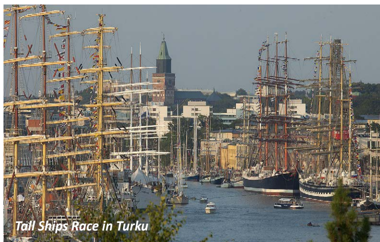
Tall Ships Race in Turku

Because of its long history, Turku has been the site of many important events, and it has extensively influenced Finnish history. The history of the country is closely linked to Turku, the former capital.