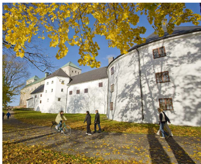
Autum colors at the Castle of Turku park on October.

Turku also has a great history in Finnish bodybuilding and fitness. The most well-known bodybuilder is Kike Elomaa who won the Ms. Olympia title in 1981. Nowadays she is a member of the Finnish parliament. Since almost 40 years, Kike has motivated Finnish women to train in the gyms. That is probably one of the reasons why the Finnish team is so successful at the international fitness sports events nowadays.