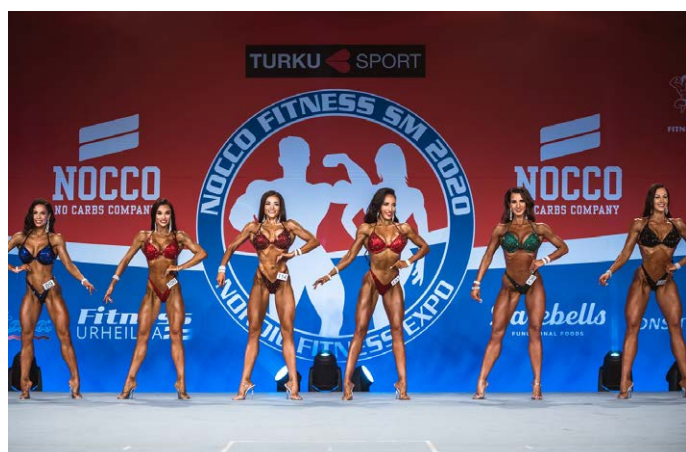
Overall posedown at 2020 Finnish Bikini Fitness National Championships.