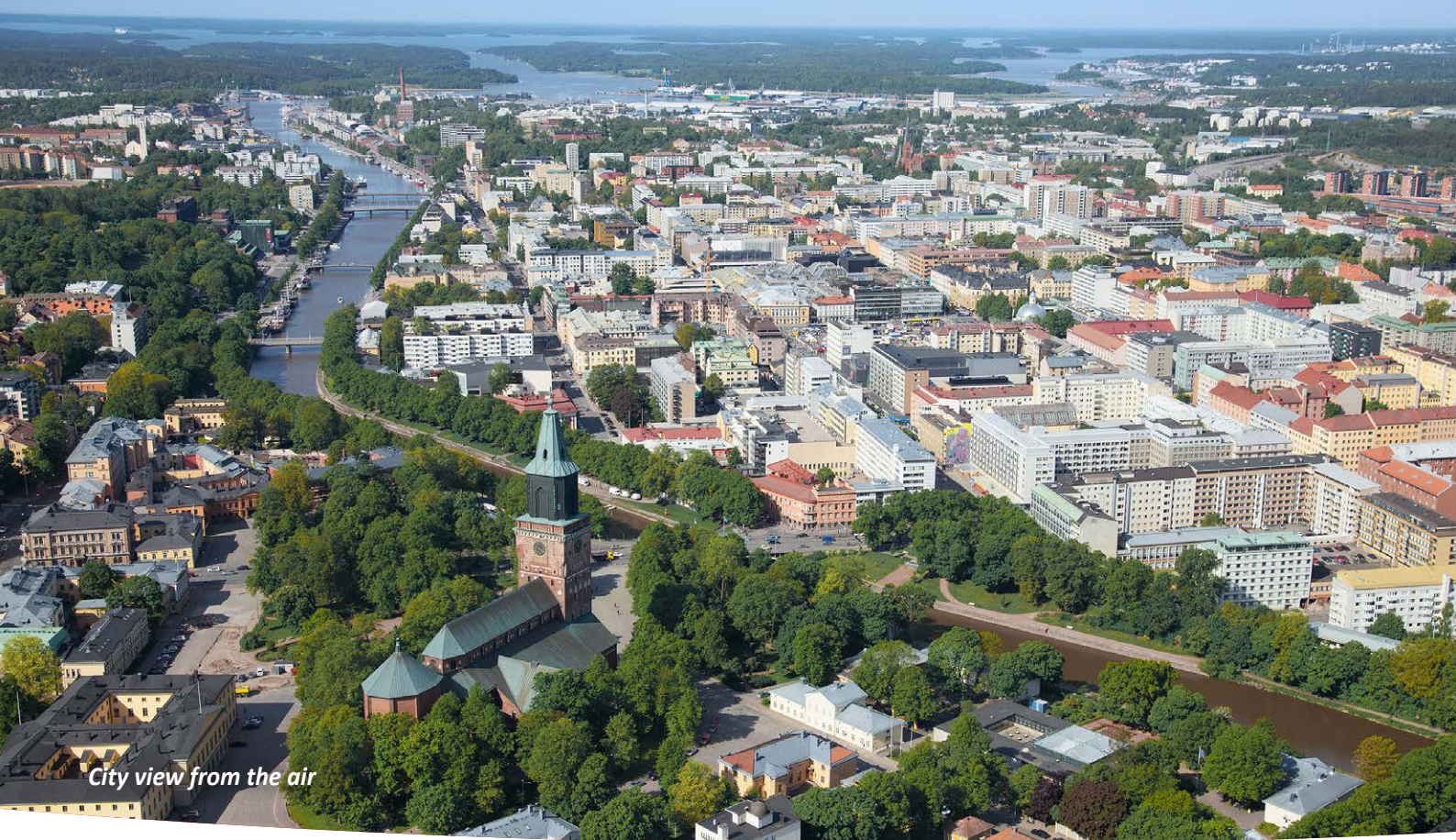
City view from the air