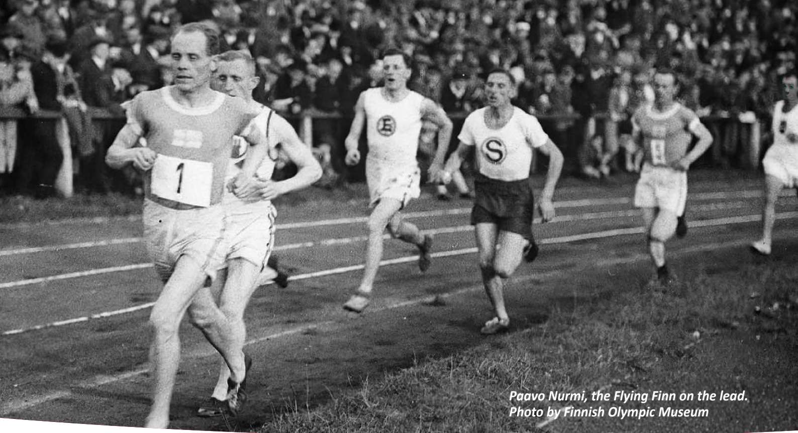
Paavo Nurmi, the Flying Finn on the lead.