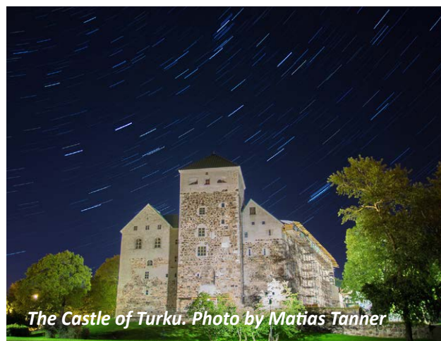
The Castle of Turku.